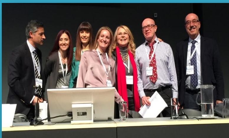
Novel approaches to psychotherapy – EFS and ESSM interactive symposium